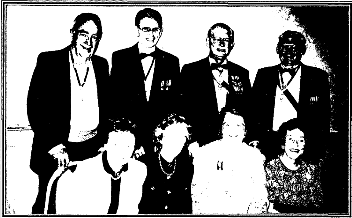
THE SAN FERNANDO VALLEY CHAPTER DELEGATION